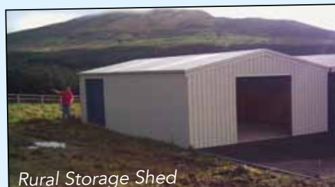
Rural Storage Shed