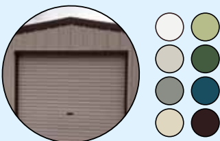
Extensive Colour Range