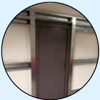
Personal Access Doors